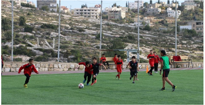
Children playing football in Kufur Nimeh

Youth in Kufur Nimeh are very interested in sports, yet the only youth club in the village lacked the seating for youth and parents to sit and watch the games. Through YWCA workshops, the community decided to upgrade their facilities and encourage the youth to visit the club by putting in seating for families to sit and watch and improving their cafeteria. The club will also be able to host football games with other clubs and teams